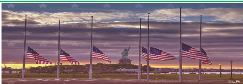
Blessing for the Fallen of 9-11

God of mercy, in your word of Scripture, you instruct us to "Do to others as you would have them do to you." Give us today the courage to assist those around us who may need our assistance. Give us patience when we become impatient. Remind us to pray for all those who perished on United Airlines 93, American Airlines 11, United Airlines 175, American Airlines 77, and those in the Twin Towers and Pentagon. Give us a heart thankful for those who gave their lives as first responders, as did the men and women who ran into danger to be of aid. We ask all this in the name of the One who first responded to our need for a savior, Jesus the Christ. Amen.